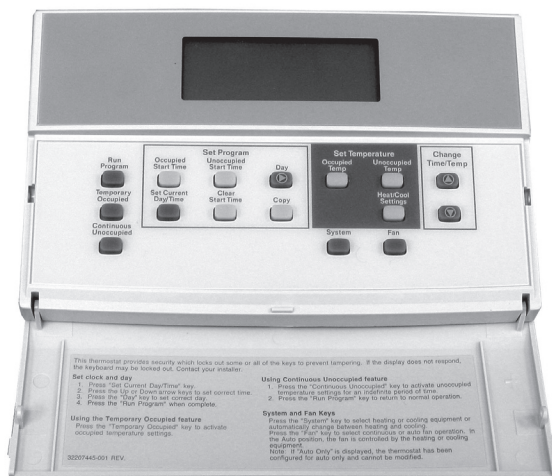
Figure 1 • TH-7300 Thermostat