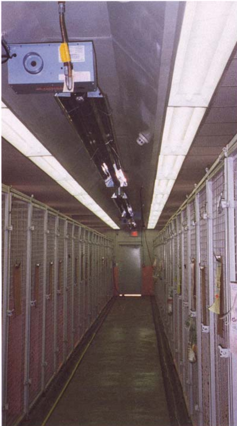
Shown above is a DBS 20-40 residential tube heater installed at Kennelwood Village in St. Louis.