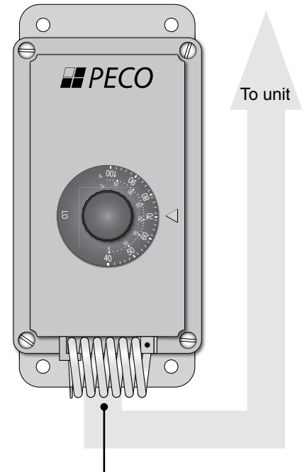
Figure 1 • TH-109 Thermostat

Ensure the 1/2-inch conduit opening on the end of the enclosure is installed downward. With cover and NEMA 4X conduit fittings (not included) properly installed, the enclosure will meet NEMA 4X rain-tight ratings. NOTE: A drip-loop should be provided to prevent water and other liquids from entering the thermostat housing. Failure to use suitable watertight connections could result in thermostat failure.