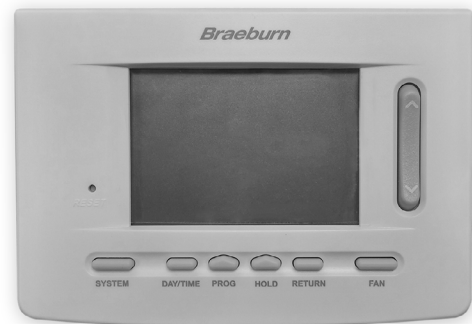
Figure 1 • TH-BR52 Thermostat

To avoid electrical shock or damage to equipment, disconnect all power before installing or servicing.