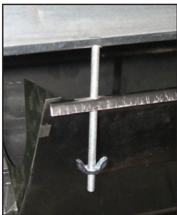
Figure 3 • Wing Nut