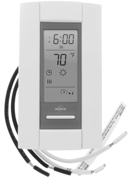
Figure 2 • TH-PTLV Operational Buttons