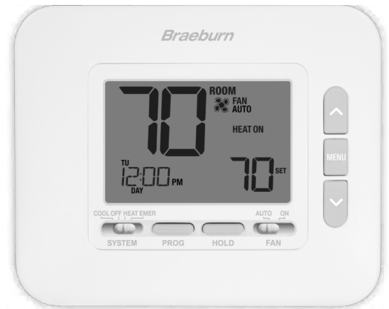
Figure 1 • TH-BR22 Thermostat

To avoid electrical shock or damage to equipment, disconnect all power before installing or servicing.