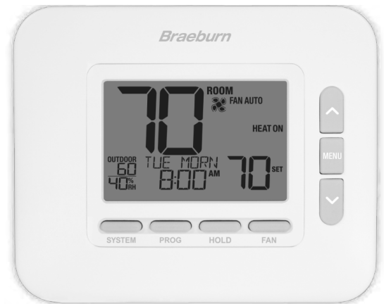
Figure 1 • TH-BR42 Thermostat

To avoid electrical shock or damage to equipment, disconnect all power before installing or servicing.