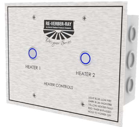
Figure 1 • TH-DSP2Z Controller

Features: 1-hour backup timer with override, heater fault indicator, & adjustable timer duration (30, 60, or 120 mins.)